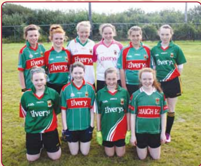
Members of the Girls Gaelic panel wearing their Mayo jerseys with pride at a training session in September.