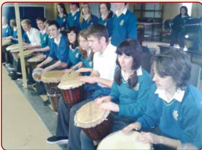
Transition Year students taking part in their annual Samba Drumming workshop