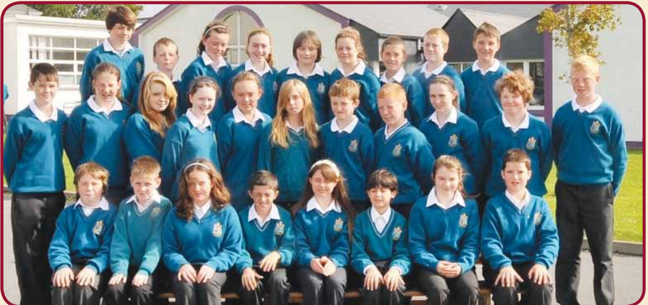
Pictured are the 1st year students at Sancta Maria College.