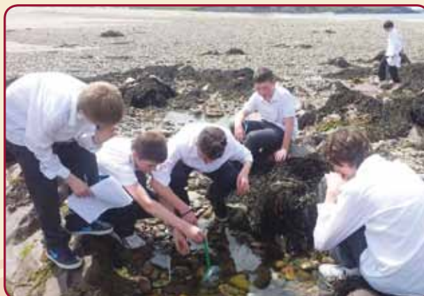
A group of science students working on their ecology fieldwork project at Carrowmore Beach as part of their Junior Cycle syllabus.