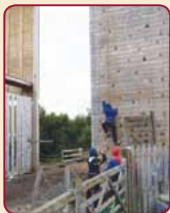
TY students climbing the wall at Little Killary Adventure Centre last September as part of their Ty induction trip.