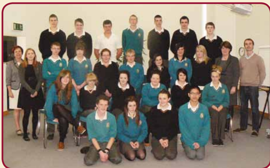
Pictured are the students from both schools who are taking part in the project along with their teachers and school principals.

Using a variety of communication channels, including e-mail, text, land mail and social media, students can contact relatives, friends and past pupils and invite them to participate and raise money which will be used to promote a state of the art outdoor exercise park. Parents, neighbours and fellow students are encouraged to take part and answer questions about Mayo in general and Louisburgh in particular. Further details are on www.iquestireland.com and www.sanctamaria.ie . The closing date is January 20th 2013 so please contact those overseas over Christmas.