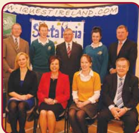
Students and staff from Sancta Maria pictured with the members of the Iquest Ireland team and main sponsors at the official launch in November.